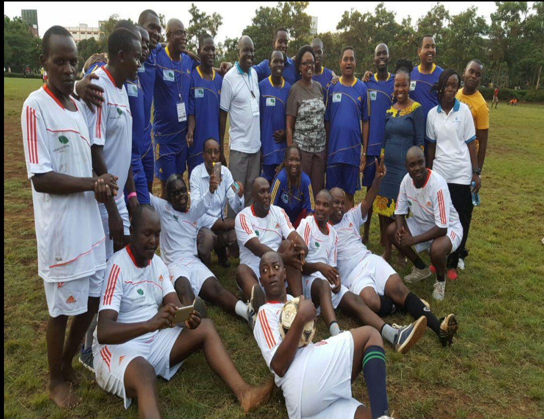
MM with the Kenya Medical Doctors during their April 2016 Conference